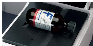
The Universal Platform Sampling accessory with Bottle Holder for the DXR3 SmartRaman Spectrometer