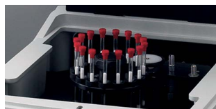
The Carousel Autosampler Sampling accessory for the DXR3 SmartRaman Spectrometer