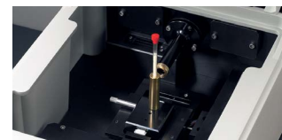
The 180 Degree Sampling accessory for the DXR3 SmartRaman Spectrometer