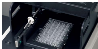
The Universal Platform Sampling accessory with Well-plate for the DXR3 SmartRaman Spectrometer